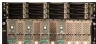
Dell™ PowerEdge™ C6100 4-node cluster